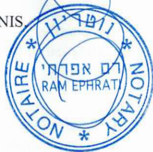
חותם הנוטריון Notary's Seal